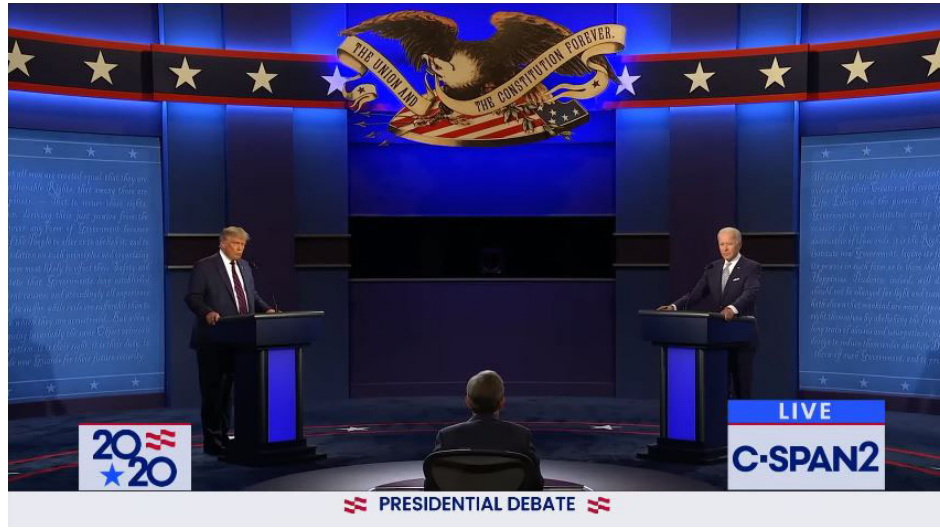
Screengrab from C-SPAN2 on the night of the debate.

COVID-19. The first question was why the American people should trust one candidate over the other when handling COVID-19. Biden thought Trump did a horrible job handling COVID and